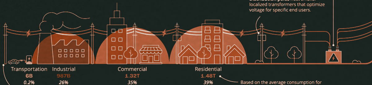
2021 Retail Electricity Sales (kWh)

Distribution poles host smaller localized transformers that optimize voltage for specific end users.